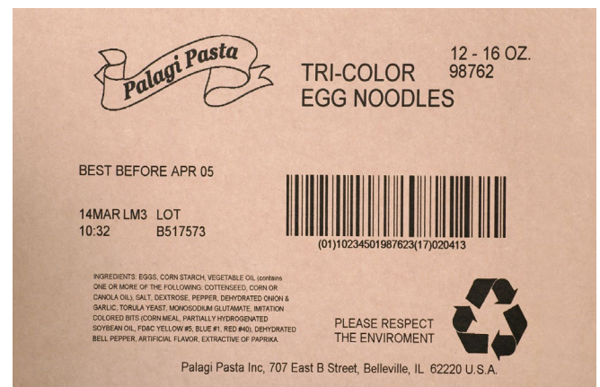
All information printed in-line with multiple high-resolution inkjet printers.