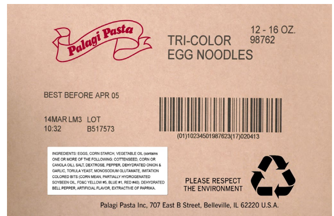
Pre-printed logos and company data. Label with ingredient listing. Variable information printed in-line with inkjet printer.

Unlike pre-printed cases, inline coding provides enormous flexibility. Messages are quickly changed, and new messages can be created and stored for immediate or future use. The printers are very compact and take up minimal space on the production line. They can print logos, graphics, large and small text, and a wide range of linear and 2D bar codes, including the increasingly popular GS1-128 bar code. State-of-the-art printers feature the ability to automatically purge ink through the printhead before every print, ridding it of contaminants to provide consistently clear, high-resolution codes.